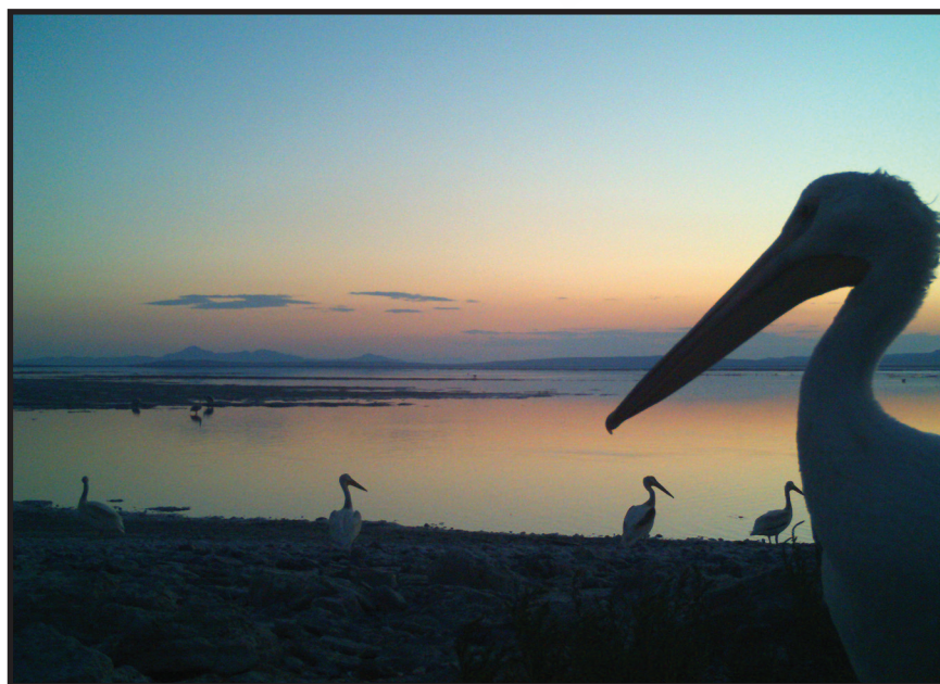
The End PELIcam on Gunnison Island

Remember, all membership fees and donations are tax-deductible to the extent allowed by law.