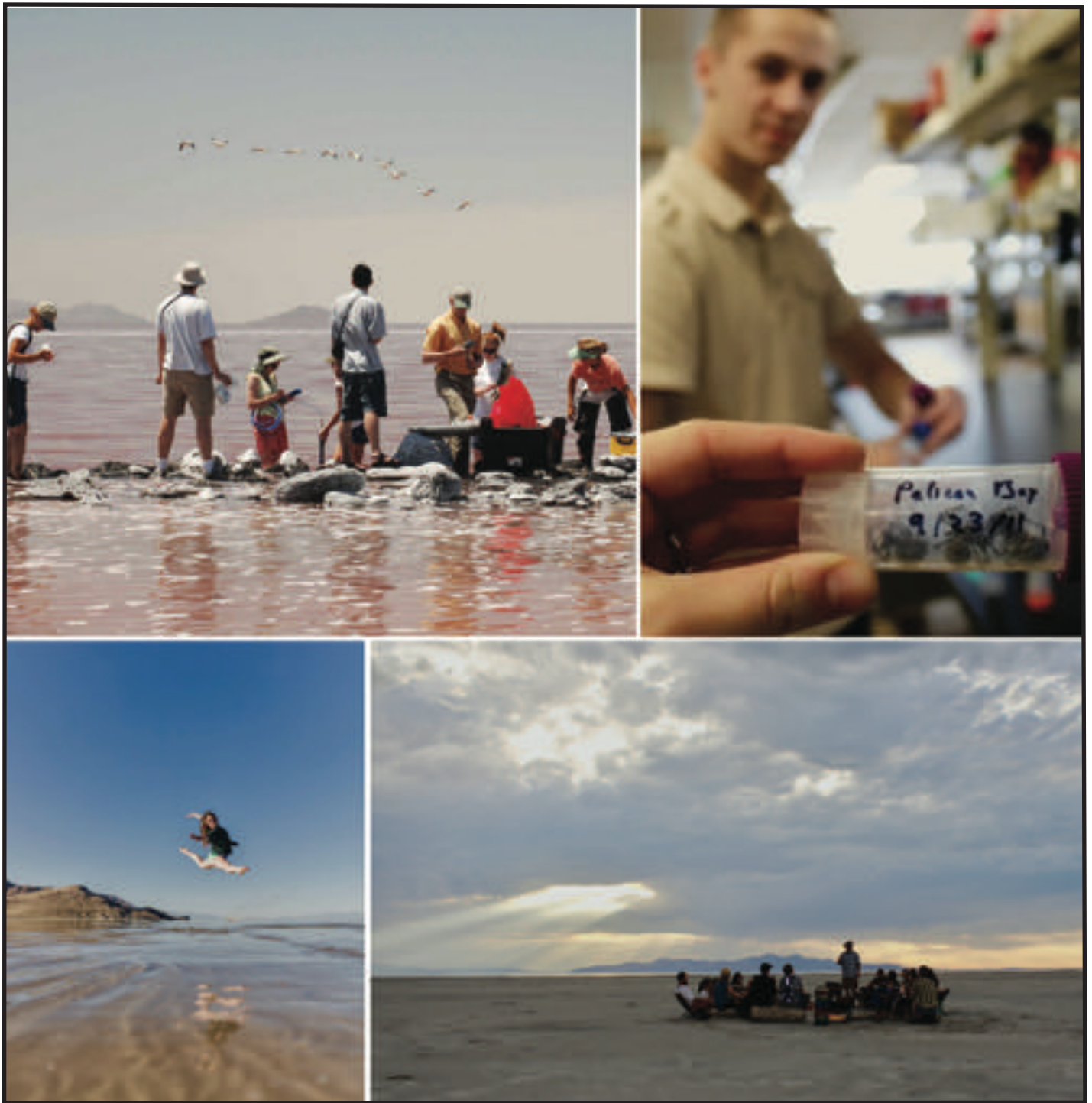
Great Salt Lake Institute at Westminster College Students Conducting Research in the Field and Lab