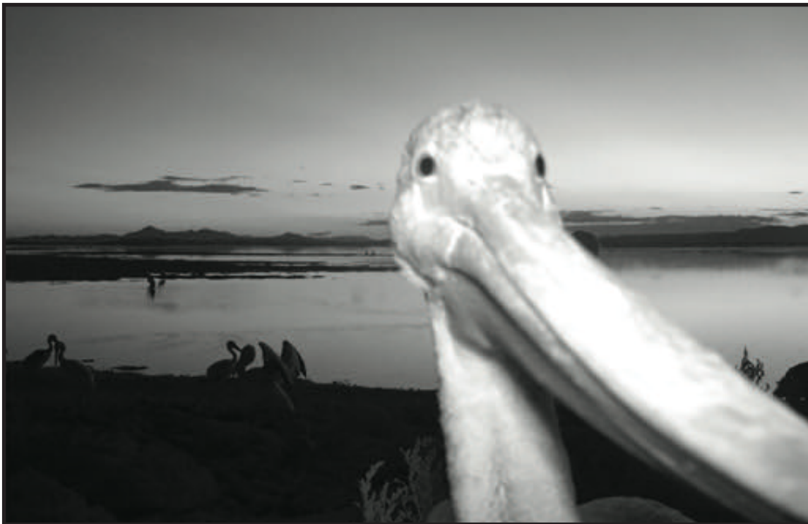
Pelican on Gunnison Island Triggers PELICam