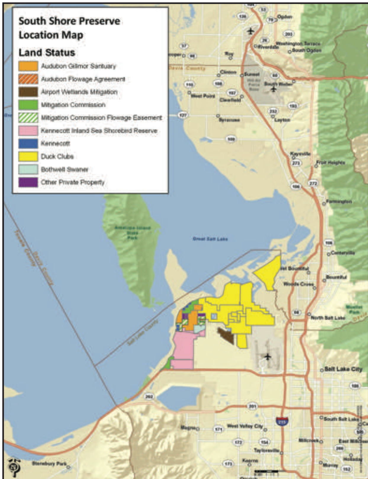
South Shore Preserve Map Courtesy of Ella Sorensen