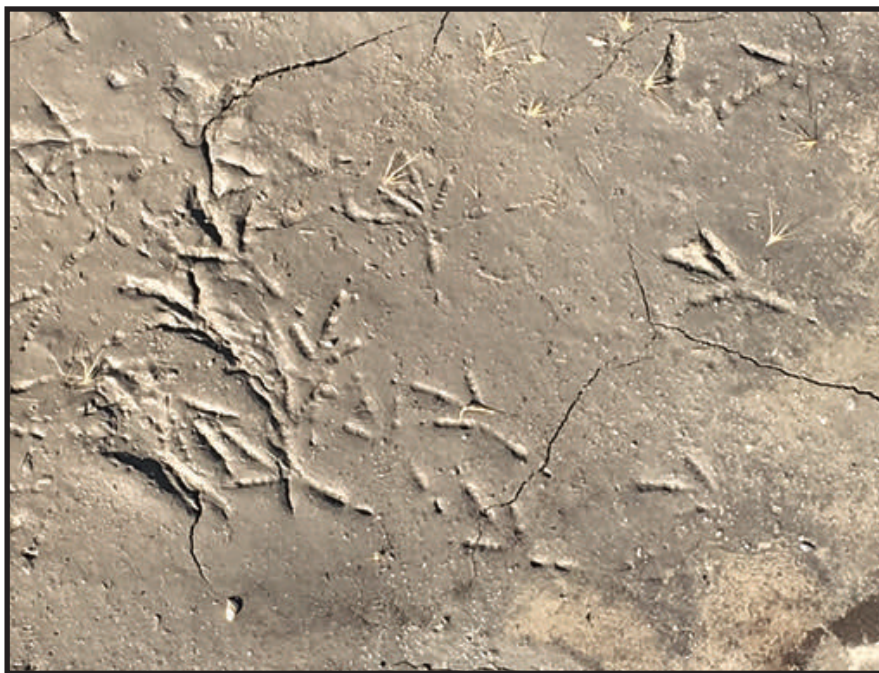
Detail of Mudflats